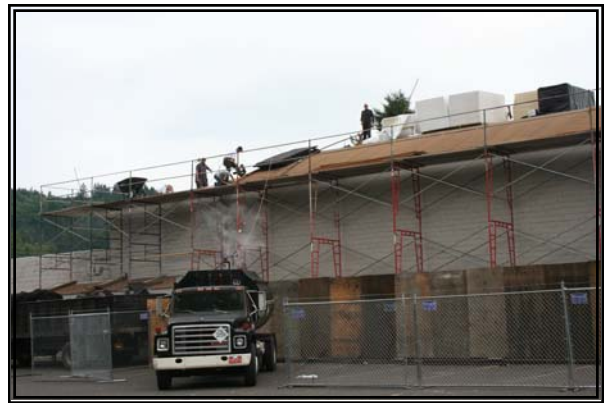
Six schools were re-roofed or had roof repairs this summer: Boring Middle (shown), Naas, Kelso, Sandy Grade, Cedar Ridge, and the current Sandy High facility.