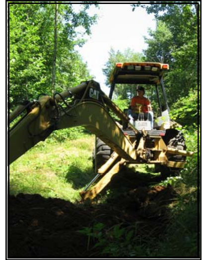
Sandy High graduate Jeff Konell, of Sandy-based Konell Construction, digs trenches on the Bell Street property.

Firwood Design Group of Sandy, and Winzler & Kelly Consulting Engineers, are partnering on the civil design projects for the new high school. Projects include site development, traffic flow, habitat and natural resources preservation, energy conservation, and more.